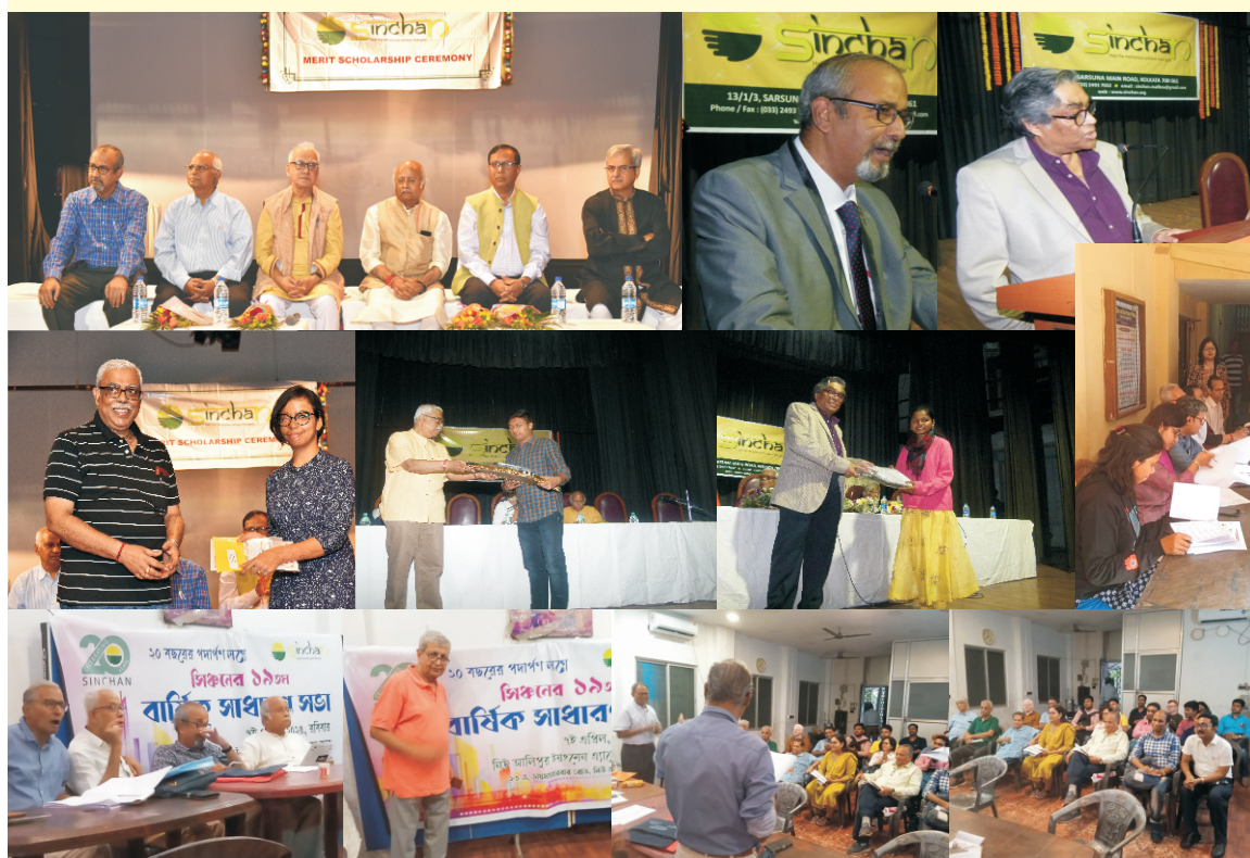
Moments during the year

INDIAN OIL CORPORATION, Kolkata comes forward, with substantial amount of donation, in every year, in aid of our SINCHAN's Annual Social Public Meet promoting our success.